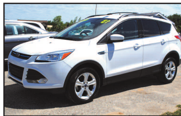
2013 FORD ESCAPE SE Eco-Boost, Sirius radio, steering wheel controls, SYNC, handsfree phone. Like new. $269 A MONTH OR LESS