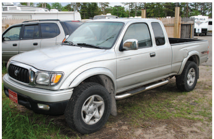
2003 TOYOTA TACOMA LIMITED EXT CAB 4WD, TRD Off Road, tow pkg, bedliner, sunroof, Pioneer sound.