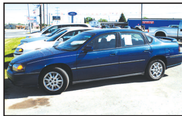
2005 CHEVY IMPALA Nice car with great MPG. SALE PRICE $5,995