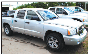
2006 DODGE DAKOTA QUAD CAB SLT 4X4 New tires, bedliner, tow pkg, V-8 Magnum. SALE PRICE $9,995