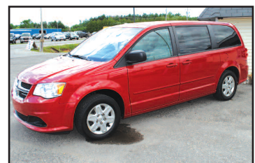
2012 DODGE GRAND CARAVAN Stow-N-Go, 4 captain's chairs, like new. SALE PRICE $13,995