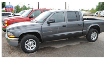
2002 DODGE DAKOTA SLT CREW CAB 4 door, low miles, rust free, bedliner, tow pkg.