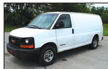
2006 GMC SAVANA 2500 Cargo Van SALE PRICE $5,995