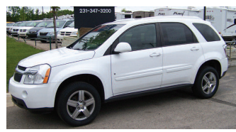
2008 CHEVY EQUINOX Leather, low miles.