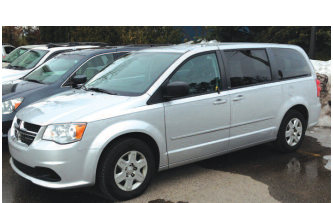
2011 DODGE GRAND CARAVAN Stow-N-Go seating.