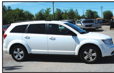
2012 DODGE JOURNEY Hands free phone, blue tooth. $249 A MONTH OR LESS