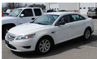
2011 FORD TAURUS Save $2,000.