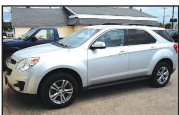
2011 CHEVY EQUINOX LT OnStar, AWD, Only 87 K. SALE PRICE $15,995