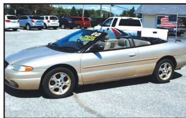
2000 CHRYSLER SEBRING CONVERTIBLE Leather. Only 76 K. SUMMER SPECIAL $4,995.