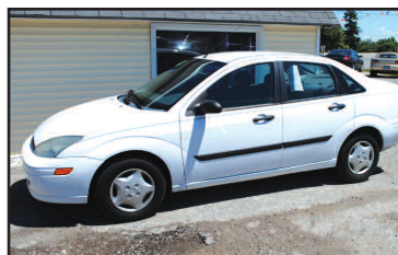
2004 FORD FOCUS Great MPG! SALE PRICE $4,995