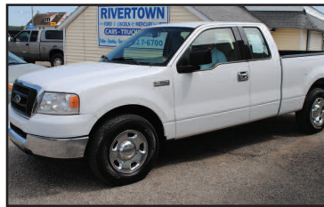
2004 FORD F-150 XL Ext. cab, bedliner, tow pkg, leather, seats 6. Nice shape. SALE PRICE $7,995