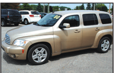
2008 CHEVY HHR LT Nice car, lots of room. SALE PRICE $7,995