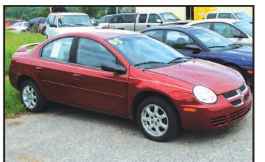
2005 DODGE NEON Auto, rear spoiler, air, cruise, auto, great MPG. S SALE PRICE $4,995

989 VFW RD., CHEBOYGAN, MI • 231-627-6700 • WWW.RIVERAUTO.NET