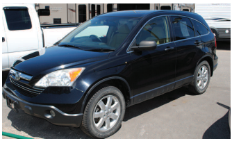
2009 HONDA CR-V AWD, great fuel economy.