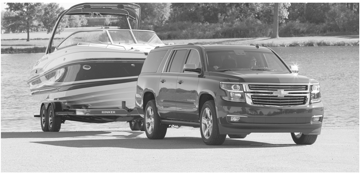
The 2015 Chevrolet Suburban has every creature comfort needed for long summer road trips, with multiple power outlets, rear-seat entertainment, and the towing capacity to bring toys along for the ride."