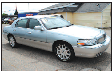
2007 LINCOLN TOWN CAR Signature Series, Leather, loaded, 99 K. SALE PRICE $11,900

TONS OF VEHICLES IN STOCK. MORE ARRIVING DAILY!