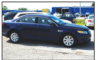
2011 FORD TAURUS Hands free phone, nice car. $239 A MONTH OR LESS