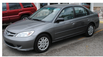
2004 HONDA CIVIC LX 5 speed, 109 K, Southern car, no rust, great economy.