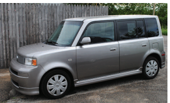
2006 SCION XB. Only 93 K, lots of room, great economy.