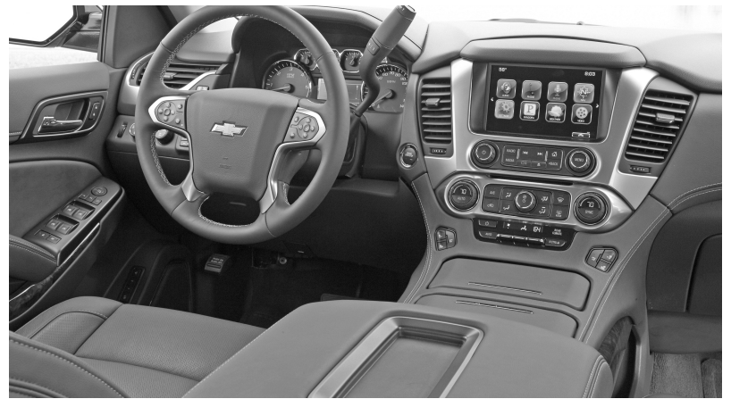
The all-new Chevrolet Suburban and Tahoe went on sale earlier this year. Sales are up 14 percent year-over-year through May."

Full-size SUV keeps modern families entertained and connected, too