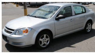
2007 CHEVY COBALT Low miles, fuel saver.