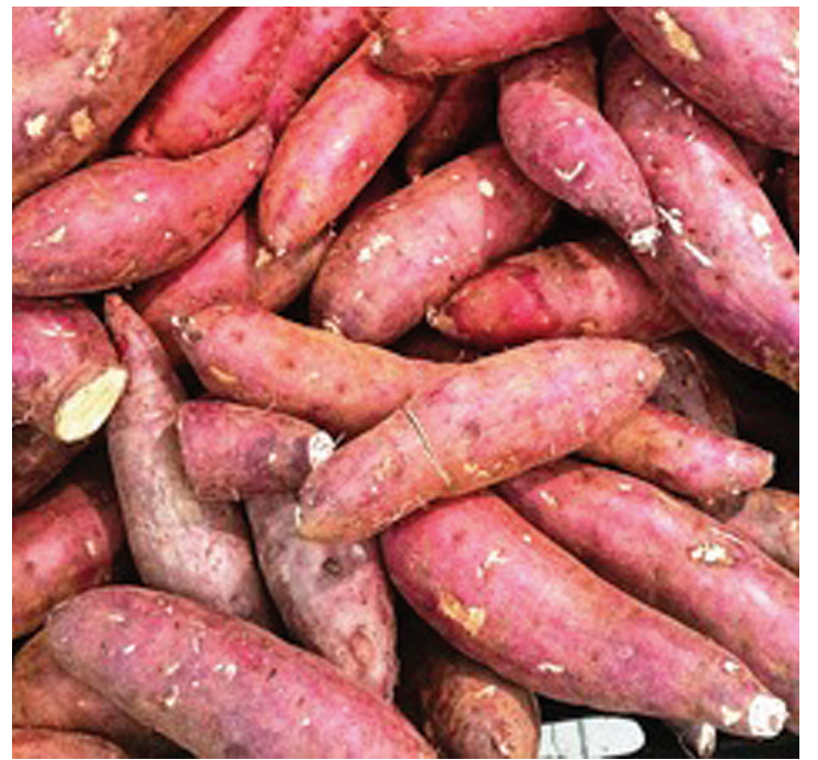
With a lower glycemic index than the white version, sweet potatoes are a better choice for persons with diabetes. FROM WIKIPEDIA COMMONS

Eliminating animal products means avoiding red meat, poultry, fish, dairy products and eggs. For the greatest benefit of a plant-based diet, eliminate animal products entirely. A vegan