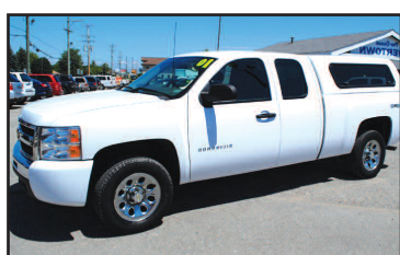
2010 CHEVY SILVERADO 1500 Ext cab, seats 5, 4x4, fiberglass topper, tow pkg. SALE PRICE $14,995